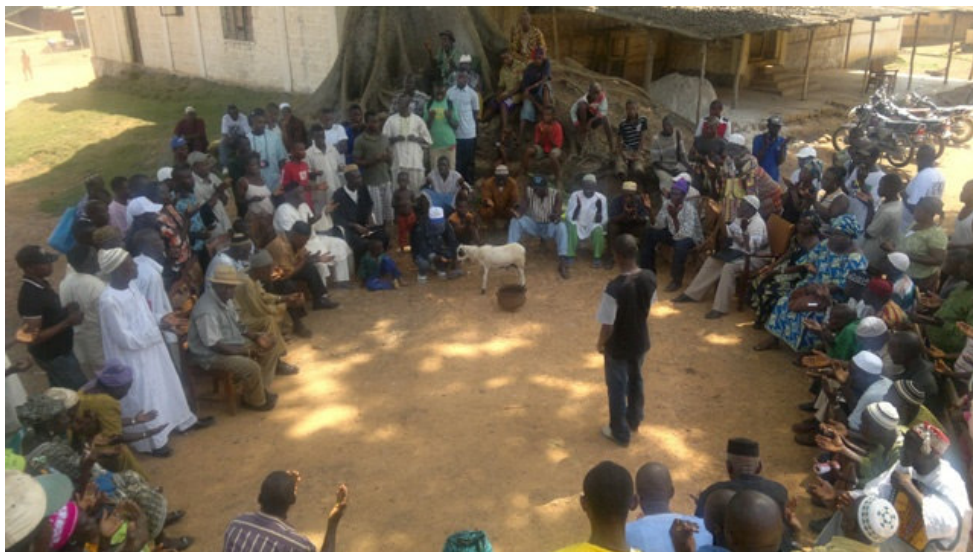
Prayers were offered before the slaughtering of the sacrificial lamb for peace and unity to prevail in the chiefdom.