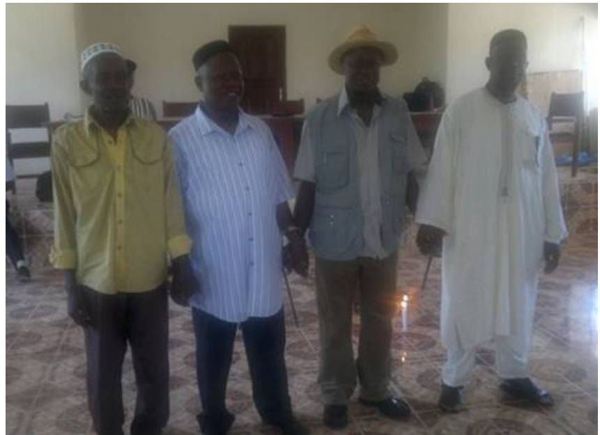
A demonstration of unity between the aggrieved parties